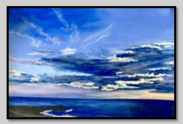
MaryAnn Goodwin The Table is Set Watercolor