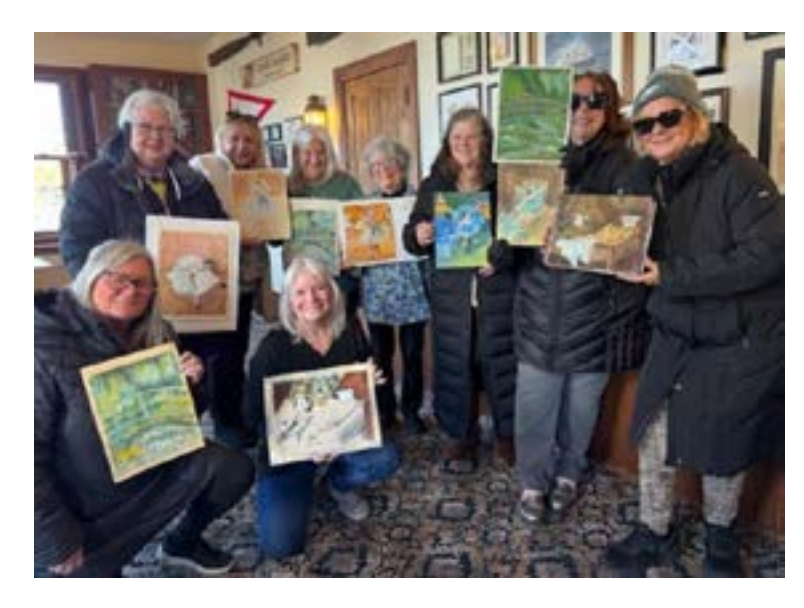
A great Pastel Class at the Sea Girt Lighthouse!