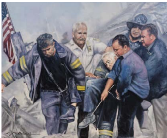
Nine Eleven Responders • oil • 2013