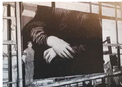
Mona Lisa's Hands • Feb. 1963

VISIT US ON THE WEB www.edgemagonline.com