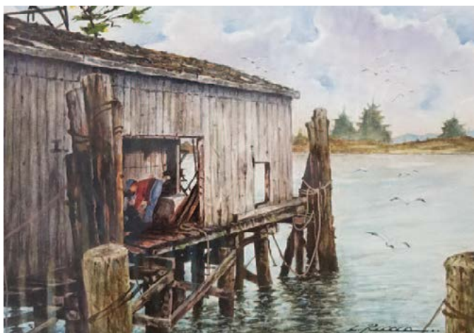
Local Lobster Shanty • watercolor • 9" x 13" • 2008