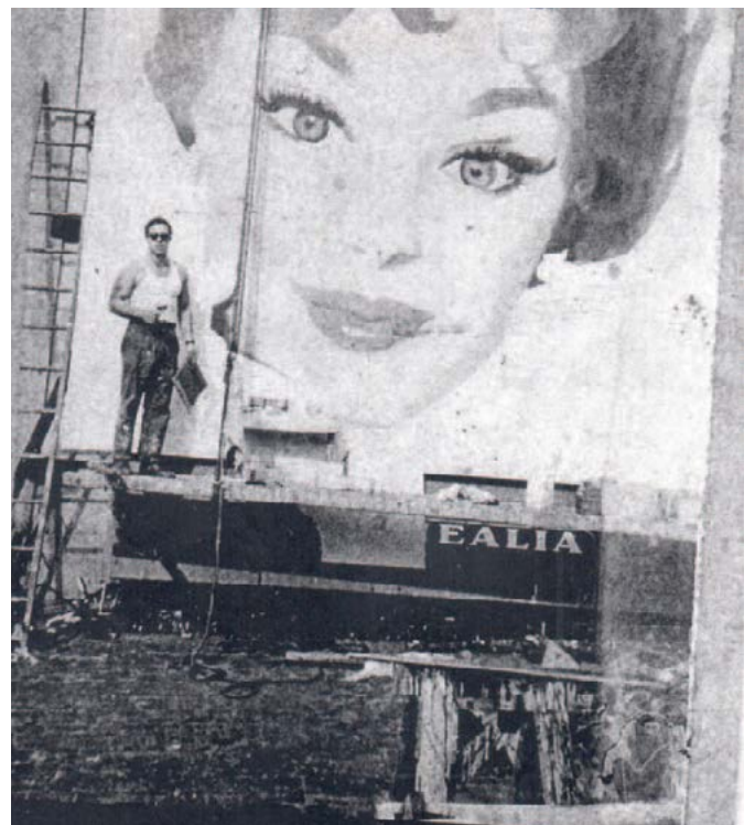
Detail of billboard for Opici Wine • 1960