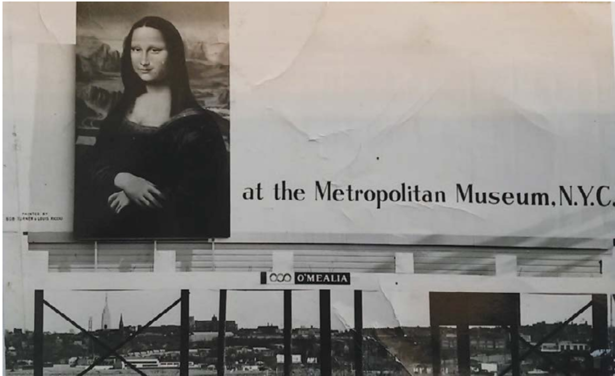
Metropolitan Museum billboard • 1963