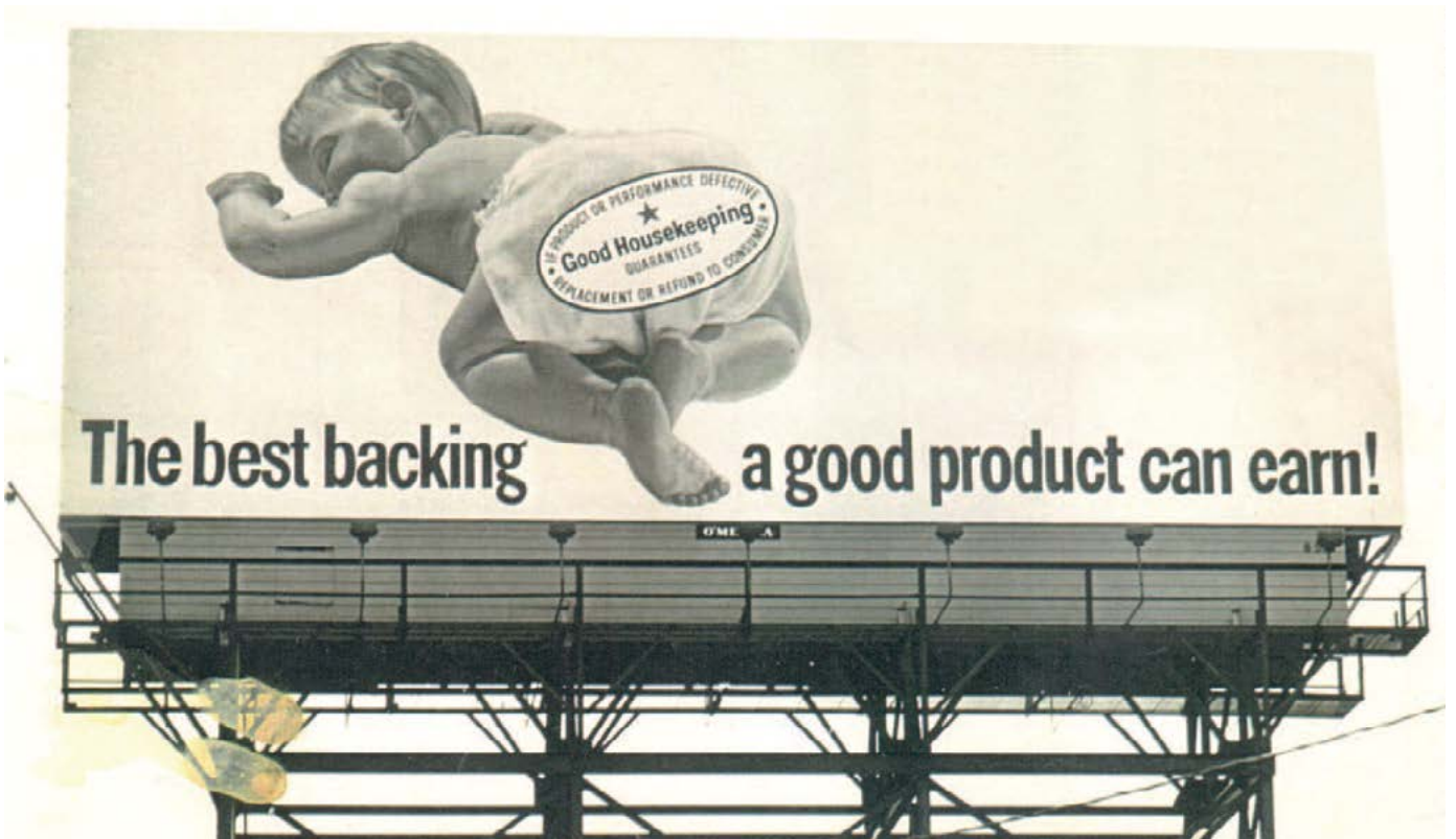
Good Housekeeping billboard mural • 1967