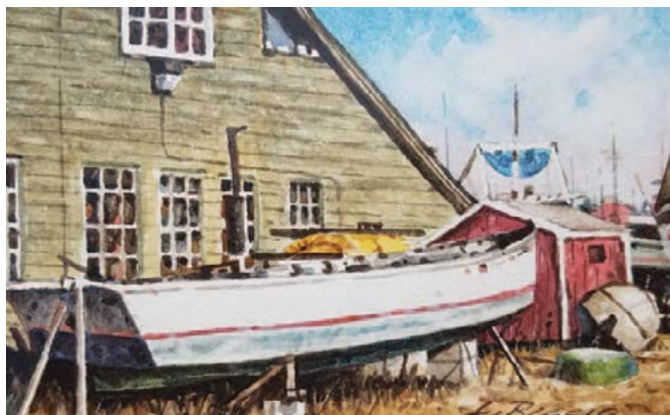
Beaton Boat Basin • Diptych watercolor • 4" x 6" • 2008