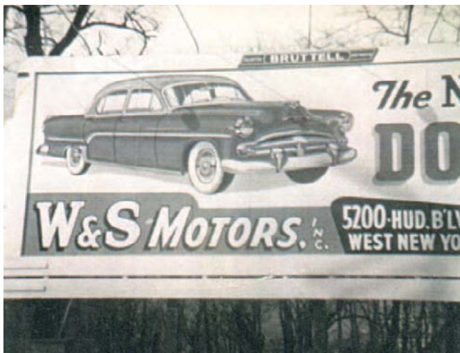
W&S Motors billboard • 1950